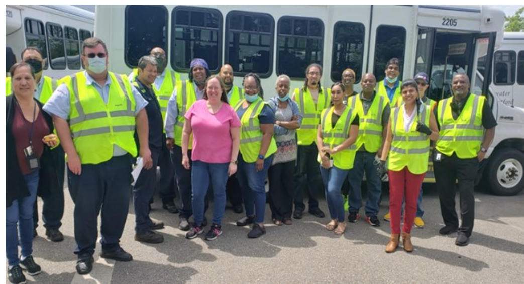
Pictured: First Transit and the Greater Hartford Transit District staff team up for a day of fun, food, and safety skill testing at the annual Safety Pep Rally in First Transit's parking lot at 148 Roberts Street, East Hartford.

The annual Safety Pep Rallies are not only a great team-building event, but are an educational refresher course in safety protocols while providing an enjoyable day for both the District and First Transit staff. Safety is always our number one priority for both our drivers and passengers!